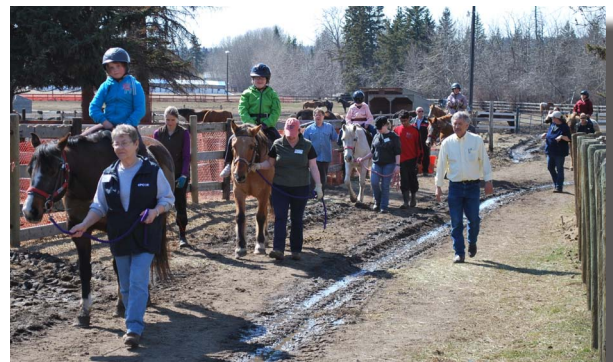
Riders and volunteers enjoying the Whitemud facility - outside and in

As a new volunteer coordinator I am privileged to work with these wonderful people, and get closer to riders and their families. While I am not new to Little Bits, having been on the Board of Directors for 10 years and in charge of the newsletter for much of that time, I am learning to see Little Bits from a new and very enjoyable angle.