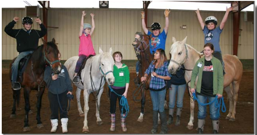
A riding group at the new St. Albert Facility