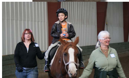
Riders and side-walkers at the new St. Albert location